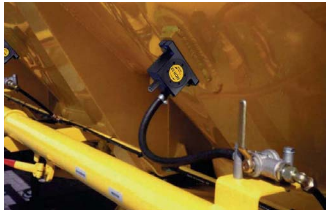
Emptying silo trailers