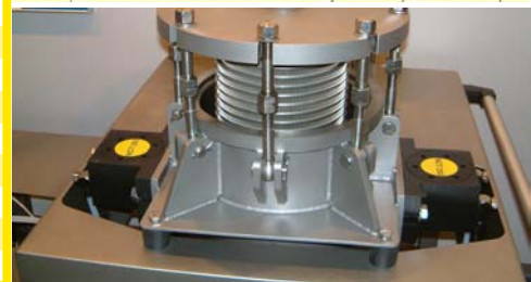
Sifting of fine grained products

* dimensions for mounting horizontal, bore Ø E