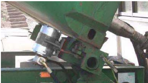
NHG 3000 L