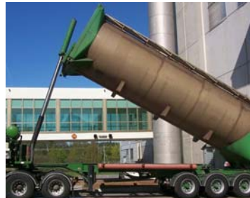
Emptying silo vehicles