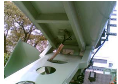
NHG 900 L