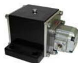
NHG 500 L