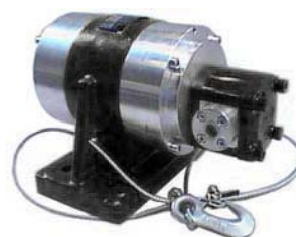
NHG 3000 L