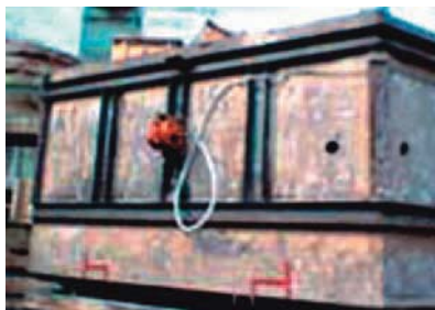
Compacting of moulding sand