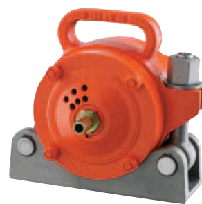
NVT with bracket NVH 4