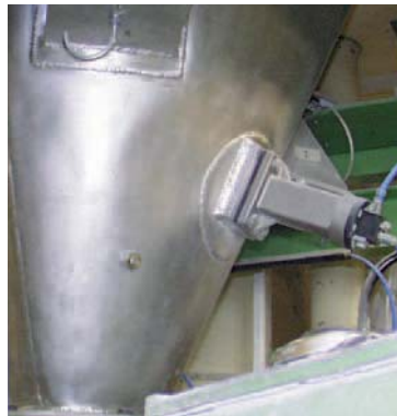
Cleaning bunker walls