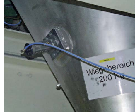
Cleaning weighing containers