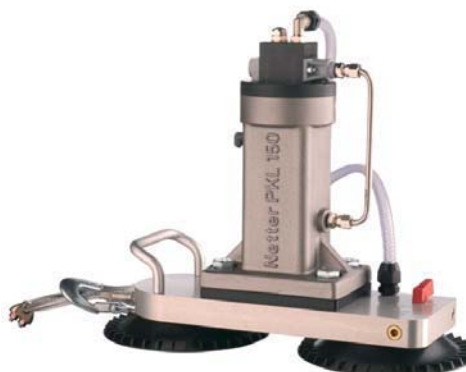
VAC 15 with PKL 150 ST