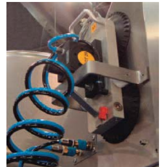
Mobile use on stainless steel container