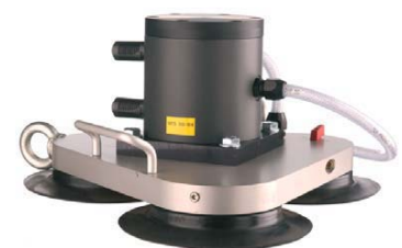
VAC 30 with NTS 50/04