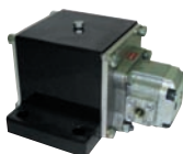
NHG 500 L