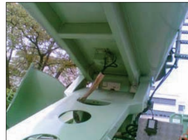
NHG 900 L