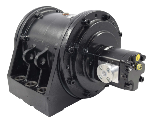
NHG 6000 L