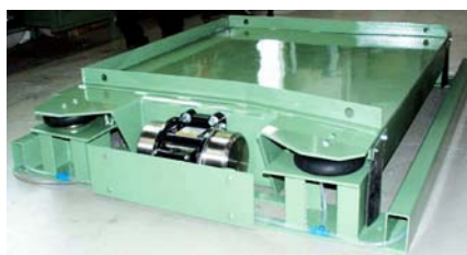
VTH/W 12/12 with 2 NEG 501510 for a weighing machine

NetterVibration offers the accessories required for the mounting, installation, control and monitoring of vibrators and vibrating tables.