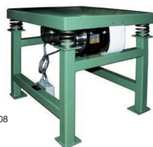
VT 7/8 with 2 NEG 50770 electric