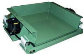
VTF 8/8 with 2 NTS 50/08 flat design