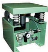
VTP 3/3 with NTS 350 NF pneumatic