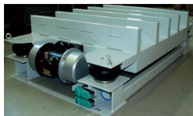
VTE/R 10/12 with 2 NEG 251370 E for applications conforming to ATEX