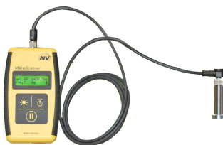
VibroScanner handheld unit