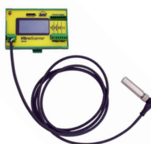
VibroScanner for control cabinet installation