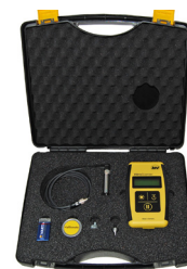
VibroScanner carrying case