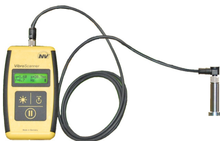
VibroScanner handheld unit for flexible and fast measurements of acceleration, frequency and amplitude